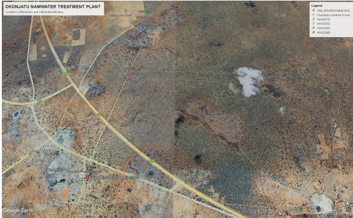
Figure 1: Site location of the Chlorination Building and Boreholes

Table 1 shows the coordinates of the building and boreholes location.